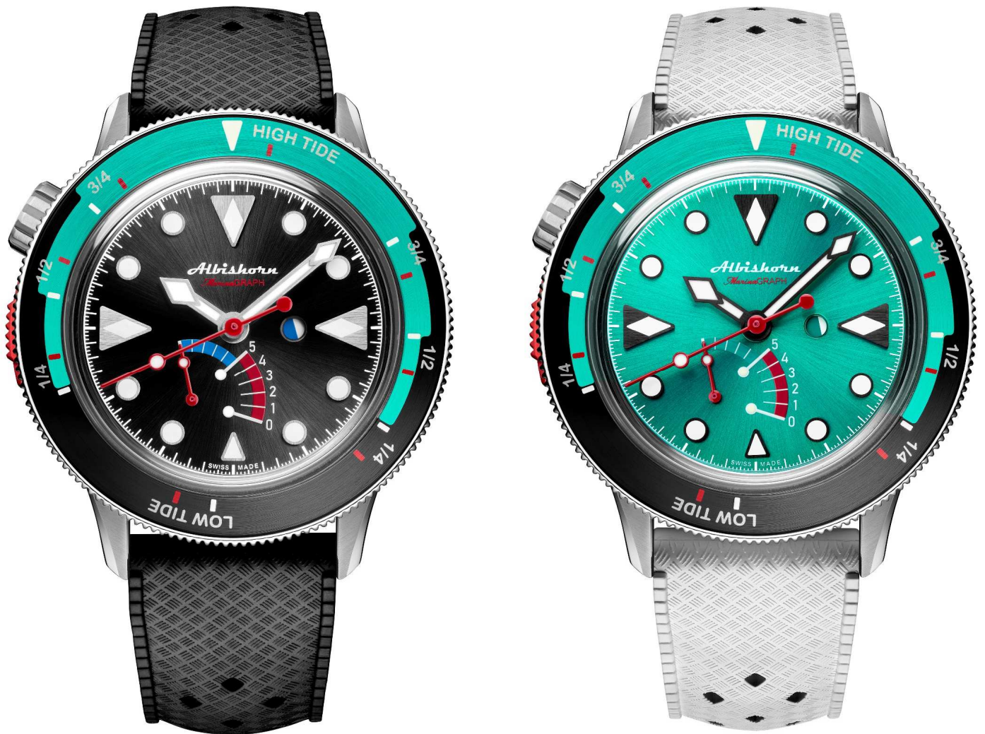
The Marinagraph Classic Racing and the Marinagraph Paraiba Racing

Enhancing this clarity—and unlike any other mechanical chronograph wristwatch—the Marinagraph integrates a patented 10-minute retrograde regatta countdown at 7 o’clock, complemented by a colour-accented aperture at 3 o’clock that serves as a running indicator.