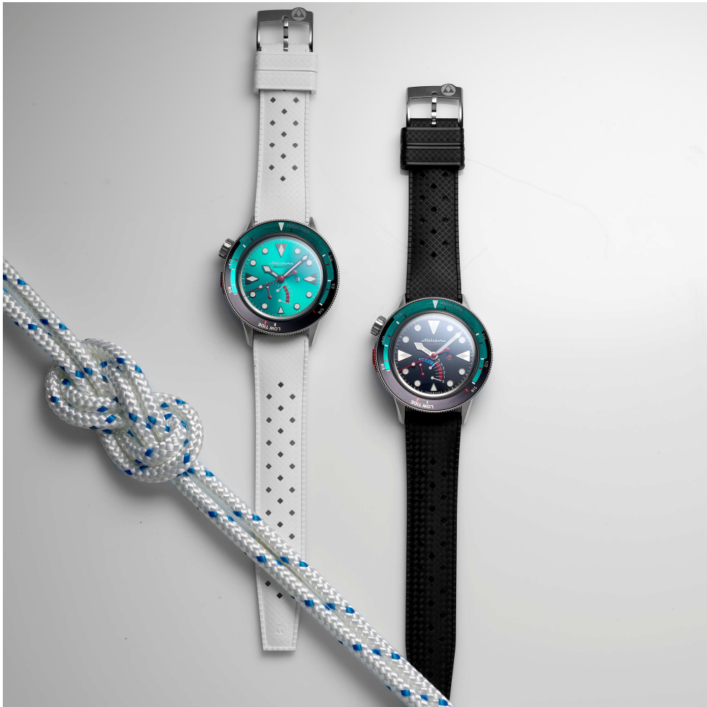
The Marinagraph Paraíba Racing and the Marinagraph Classic Racing

The Marinagraph is one such creation: the untold chapter in the evolution of the skin diver chronograph.